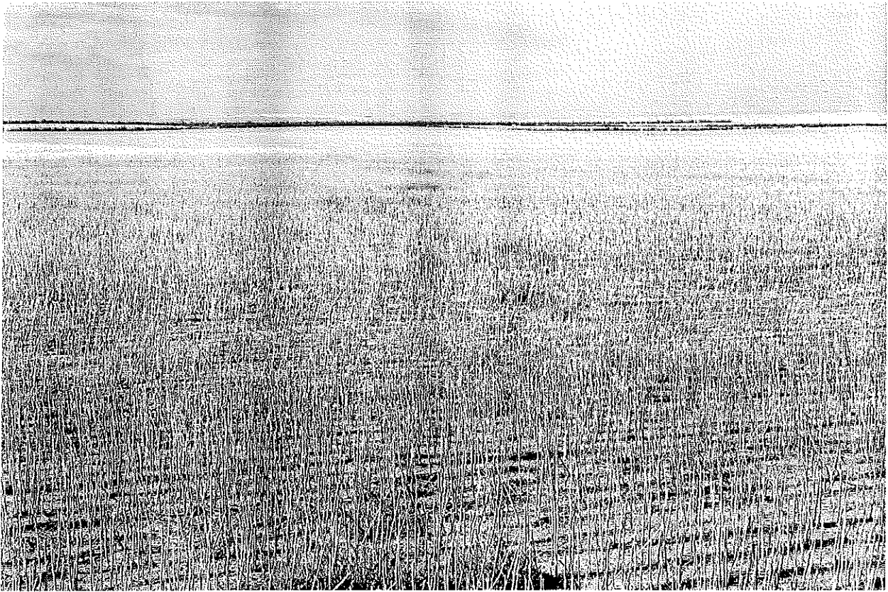
Figure 3. Glyphosate-resistant kochia post-harvest in canola in fall, 2013.