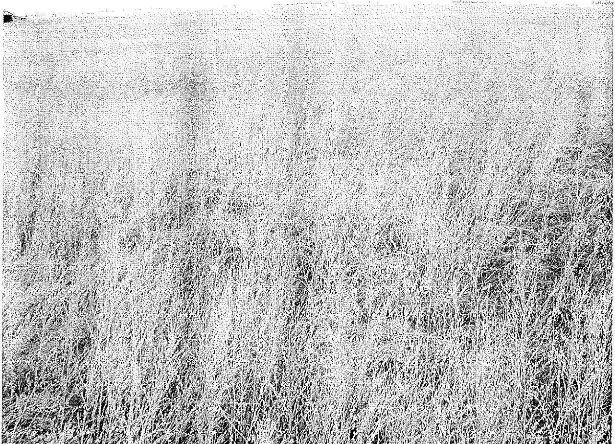
Figure 2. Glyphosate-resistant kochia in lentil.